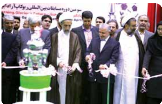
Continue from Page 1:

"In 2009 the pre-registered teams for the 4th period of Iran international Robocop match were 741 teams, that only 320 teams were accepted for participation in the matches," he pointed out.